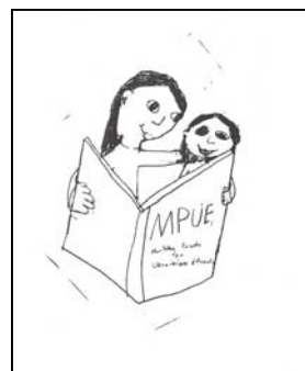
Springfield Heights Grade 3 & 4 class