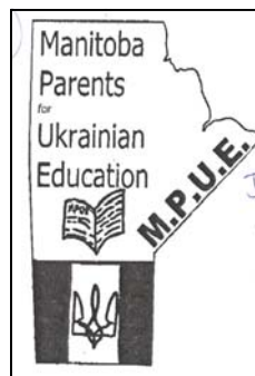
Smith-Jackson Grade 4 class