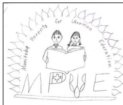
R. F. Morrison School Grade 2 class